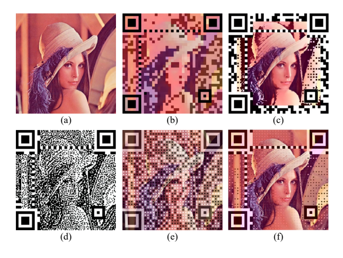
Figure 2: (a) Input image. (b-f) are the results generated by Lin et al. [2013], Lin et al. [2015], Chu et al. [2013], Visualead [2019], and our method, respectively.